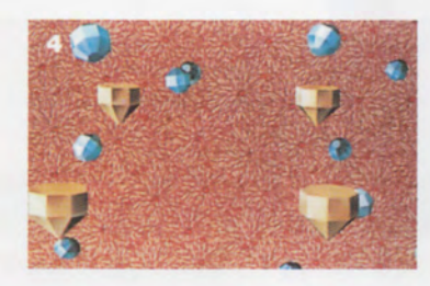
5. The prothrombin concentration (green) in the blood declines. Fibrinogen can no longer be converted into fibrin. The blood has lost its ability to coagulate.